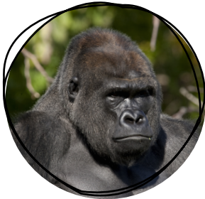
Western lowland gorilla