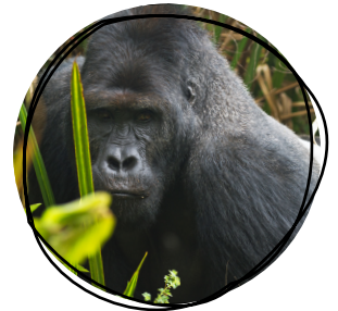
Eastern lowland gorilla

Each species has two subspecies pictured above. In total, we say that there are four subspecies of gorillas . Using the compass, their location and maybe names to help you work out which subspecies are western, and which are eastern?