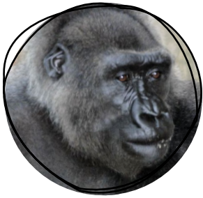
Cross River gorilla

All gorillas are related because they belong to a Genus called 'Gorilla'. Simple. In this Genus there are two species of gorilla; Western gorillas and Eastern gorillas.